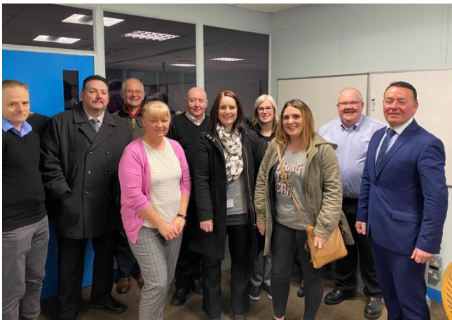
Focus group participants; Europsray, Dynamic-EMS, Lamond & Murray LTD, FLEXcon Europe LTD, Leviton Solutions Europe, Fife Fabrication, CoorsTek LTD.

Fast forward to January 2020. We held a focus group to discuss the impact of the course and assessed the level of activity since the training day's for them as managers and the wider organisation. Due to diaries eight organisations attended the focus group.