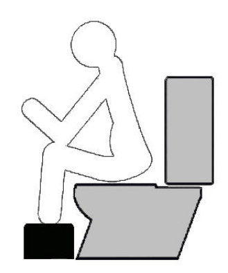
Knees higher than hips Lean forward and put elbows on knees Bulge abdomen Straighten spine

The best way to get into this better position is to put a footstool under your feet. This recreates the squatting position we were originally designed to move our bowels in. Make sure your feet are flat on the stool and that your knees are made higher than your hips. Lean forwards slightly.