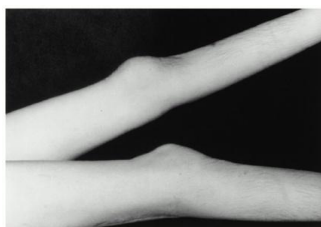
A straight knee (< 10 flexion)