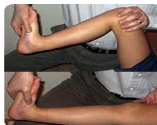
10 degrees of ankle dorsiflexion, knee straight

Regular specific stretches – similar to those shown below are important and should be done on an almost daily basis for 15-20 min.